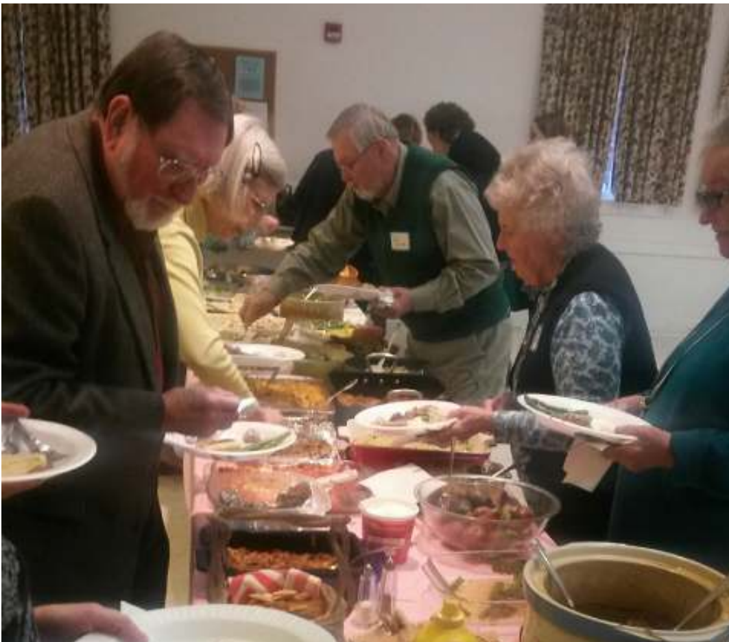
Parishioners enjoy the "interfaith potluck" dinner that was part of our Lenten Feast & Fast program.