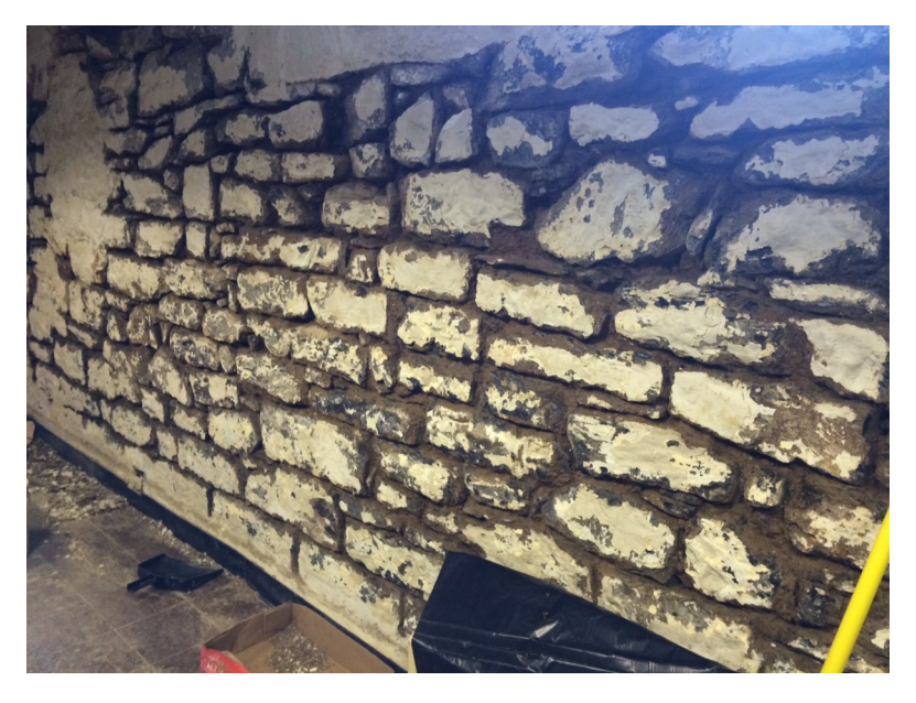
Lord Fairfax Room (church basement) —before and after