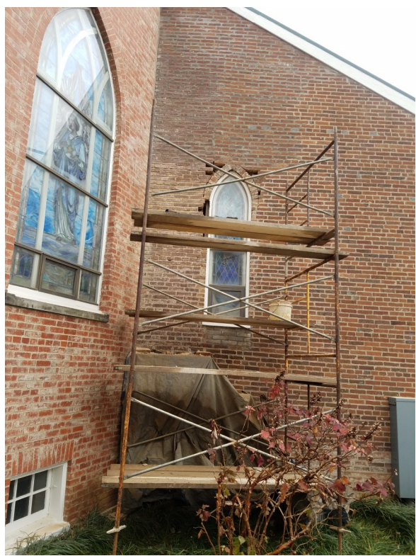
Work on Page Chapel window