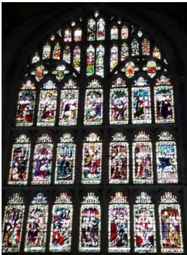
Stained glass at Canterbury Cathedral