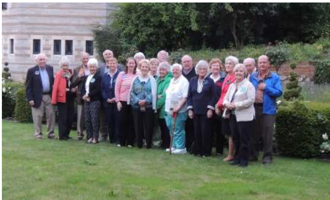
The Pilgrims following their final dinner at Canterbury Cathedral