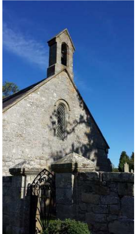
St. Mary's Holystone