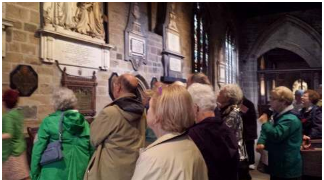
At Cathedral Church of St. Nicholas in Newcastle Upon Tyne