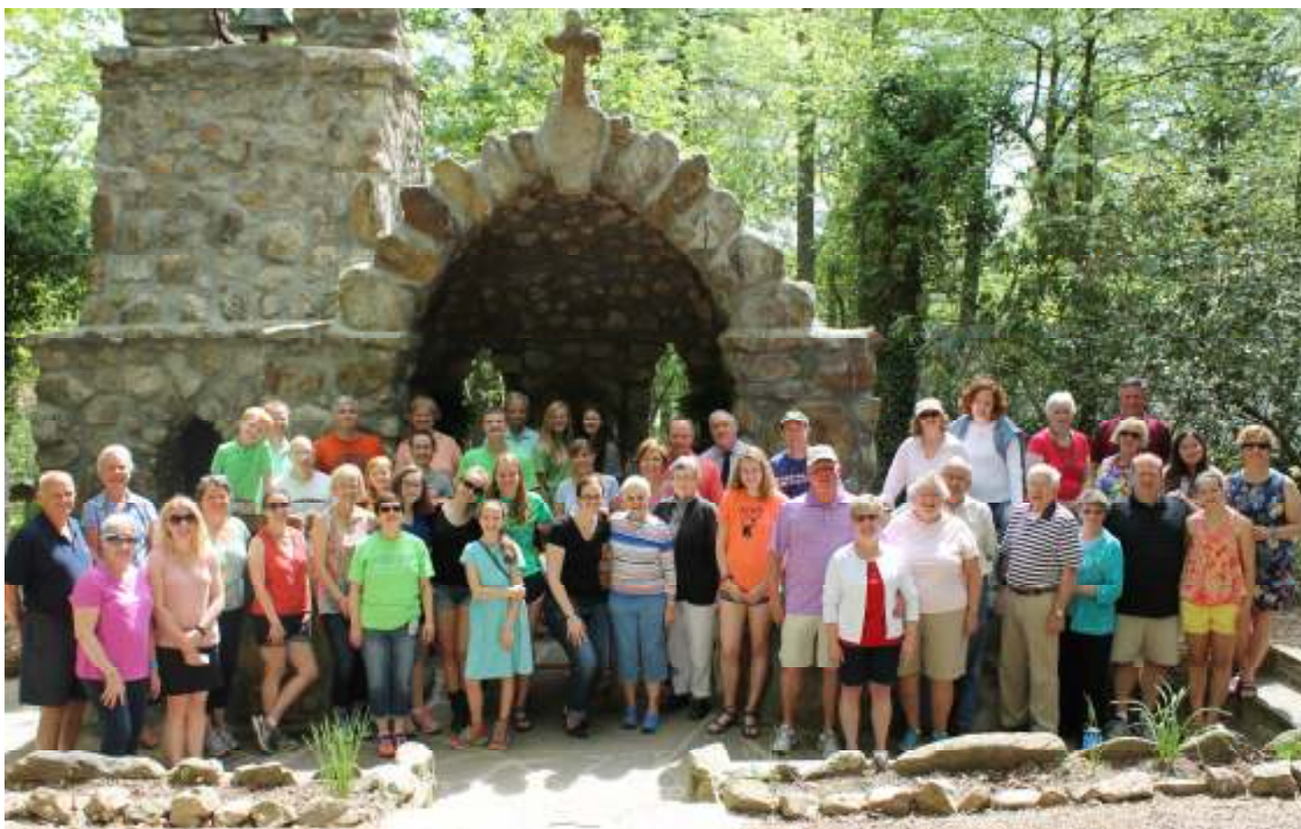
Parish Weekend 2015