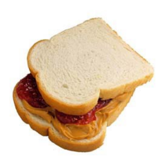
Christ Church youth and families made sandwiches for WATTS guests in February.